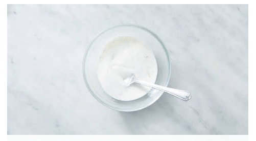
5. Make ranch

Add all but 2 lettuce leaves and toss to coat.