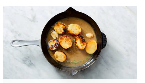
3. Add butter & broth

Heat 1 tablespoon oil in a medium ovenproof skillet over medium-high until shimmering. Add potatoes , cut side down, and cook, rotating skillet occasionally, until potatoes are deeply golden brown on the bottom, 5-7 minutes. Season with salt and pepper .