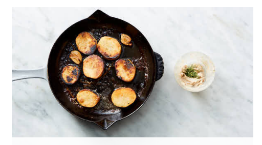
4. Bake potatoes, mix butter

Carefully flip potatoes, then add crushed garlic cloves, 4 thyme sprigs, and 2 tablespoons butter. Season other side of potatoes with salt and pepper. Cook until butter is foaming and starting to brown, 2-3 minutes more. Continuously spoon butter over potatoes while cooking. Carefully stir in broth concentrate and ½ cup water; bring to a boil.