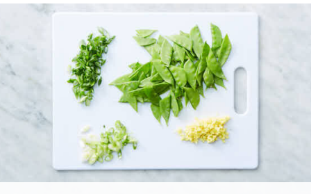
2. Prep ingredients

Bring large pot of salted water to a boil. Add udon noodles to boiling water and cook, stirring occasionally to prevent sticking, until just tender, 4-5 minutes. Reserve ¼ cup cooking water , then drain noodles. Rinse noodles with cold water and drain well again. Set noodles aside until step 6.