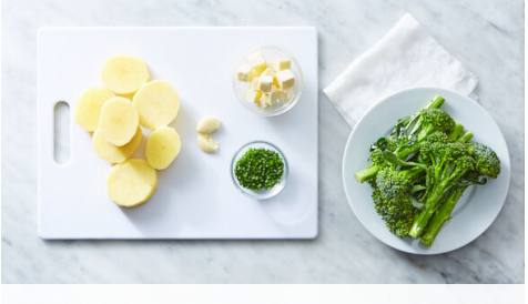
1. Prep ingredients

Calories 1180kcal, Fat 88g, Carbs 48g, Protein 67g