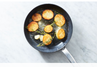
2. Brown potatoes

Peel potatoes ; cut off and discard ends, then cut into 1-inch rounds. Thinly slice chives . Cut 4 tablespoons butter into 1inch pieces; reserve for step 5. Crush 2 garlic cloves . Trim stem ends from broccolini .