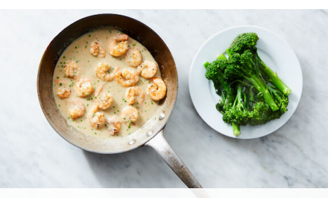
6. Heat broccolini & serve

To same skillet, add mirin, remaining broth concentrate, 1 tablespoon vinegar , and ¼ cup water . Cook, scraping up any browned bits from bottom of skillet, until reduced by half, 1-2 minutes. Add mascarpone, chives , and chopped butter . Remove from heat. Whisk constantly until smooth and creamy, about 1 minute. Stir in shrimp and steak resting juices ; discard thyme .