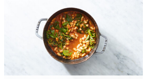
5. Simmer beans & spinach

Heat 1 tablespoon oil in same skillet over medium-high. Add meatballs and cook, turning as they brown, until seared, 6-8 minutes. Drain excess oil and reduce heat to medium; add marinara and 1/4 cup water . Simmer, turning meatballs every minute or so, until cooked through, 3-5 minutes. Transfer meatballs to a plate and cover to keep warm.