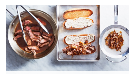
6. Assemble sandwiches

Preheat broiler with a rack in the top position. Add 1 cup water and broth concentrate to skillet with onions ; simmer until flavors meld, 2–3 minutes. Strain onions over a large bowl to catch the liquid; return liquid to skillet. Season to taste with salt and pepper . Place skillet over low heat to keep jus warm until ready to serve.