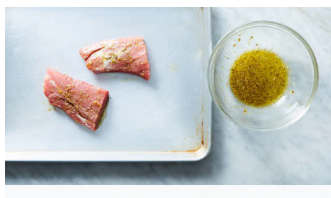
1. Marinate pork

Nutrition per serving Calories 740kcal, Fat 44g, Carbs 44g, Protein 47g