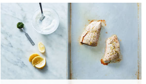
3. Cook pork & make tzatziki

In a medium bowl, combine zucchini, 1 tablespoon oil , and ½ teaspoon of the grated garlic. Season with salt and pepper , and toss to combine.