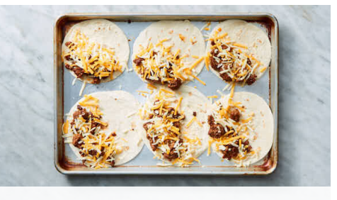
4. Assemble quesadillas

In a medium bowl, toss cucumbers with 2 teaspoons each of the chopped garlic, vinegar, and sesame seeds, 1 teaspoon each of tamari, sesame oil, and sugar, and ½ teaspoon salt. Set cucumbers aside until ready to serve.