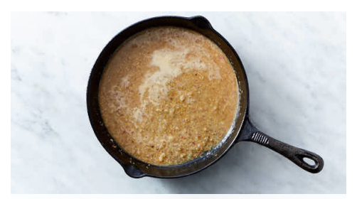
5. Make pan sauce

Pat pork dry, then season all over with salt and pepper . Heat 1 tablespoon oil in a large heavy skillet (preferably castiron) over medium-high. Working in batches if necessary, add pork and cook until golden brown and medium (145°F internally) or longer if desired, 2-3 minutes per side. Remove skillet from heat and transfer pork to a plate.