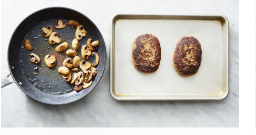
4. Cook patties & mushrooms

Into bowl with grated onion , add beef , panko , 1 teaspoon granulated garlic , 1 large egg , and ½ teaspoon each of salt and pepper ; knead until combined. Shape into two ¾-inch thick oval patties. Form a dimple in the center of each patty.