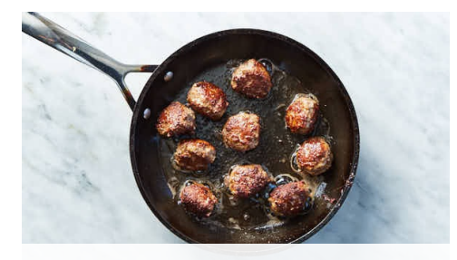
5. Brown meatballs

Add potatoes and 1 teaspoon of the chopped garlic to saucepan with boiling water; cook until tender, 7-9 minutes. Add peas and cook, 2 minutes. Reserve 3 tablespoons cooking water then drain. Return potatoes, peas, and garlic to saucepan. Add 1 tablespoon butter and coarsely mash. Add 1 tablespoon reserved cooking water as needed to loosen. Cover to keep warm over low heat.