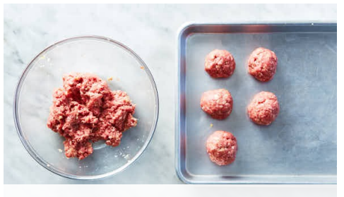
2. Prep meatballs

Finely chop 1 tablespoon garlic . Peel potatoes , then cut into 1-inch pieces. Bring a medium saucepan of salted water to a boil; cover to keep warm over low heat until step 4.