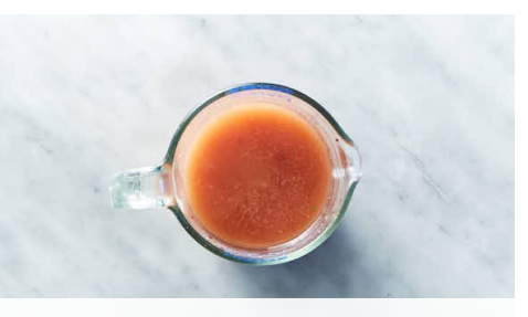
3. Make sauce

In a medium bowl, combine 1 large egg , 1⁄4 cup panko , 1 teaspoon of the chopped garlic , 1⁄2 teaspoon salt , and 1⁄4 teaspoon pepper . Let sit for 5 minutes for panko to absorb the egg. Add beef and knead or stir to combine. Using slightly moistened hands, form mixture into 10 equal-sized meatballs. Set aside until step 5.