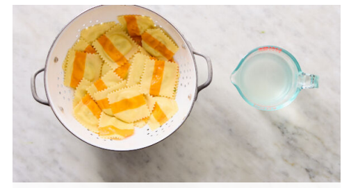
5. Cook pasta

In a food processor or blender, combine garlic cloves, toasted nuts, lemon zest, and 3 Parmesan halves; pulse until a fine crumb forms. Working in batches if necessary, add arugula and pulse until finely chopped. While processor is running, add lemon juice, ¼ cup oil, and 2 tablespoons reserved bacon fat; season to taste with salt and pepper.