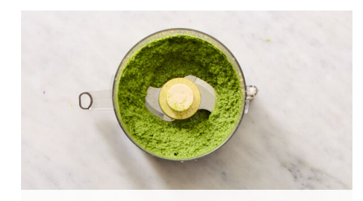
4. Make pesto

Off heat, add 2 tablespoons water to skillet, scraping up bits from bottom of skillet. Set aside.