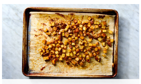
3. Finish potatoes

Roast on lower oven rack until bacon is crispy, 15-20 minutes, flipping bacon halfway through.