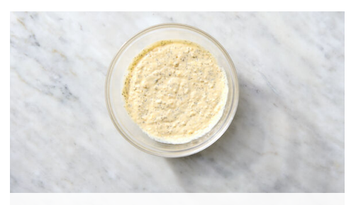
4. Mix pancake batter

Transfer bacon to a paper towel-lined plate. Stir potatoes with a spatula; continue roasting until browned and crispy, 15-20 minutes. Sprinkle with chorizo spice ; carefully toss on baking sheet to coat.