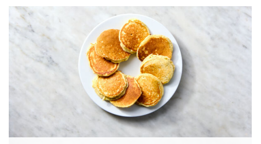
5. Cook pancakes

In a medium bowl, finely grate zest of ½ the lemon and squeeze 2 tablespoons juice. Whisk in ricotta, poppy seeds, 1 large egg, ¼ cup milk or water, 1½ tablespoons sugar, and 1 teaspoon vanilla. Add biscuit mixture and whisk until no dry flour remains (mixture will be lumpy).