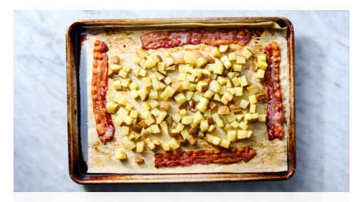
2. Roast potatoes & bacon

Scrub potatoes ; cut into ½-inch pieces. Transfer to a medium microwave-safe bowl and cover. Microwave on high for 3 minutes; uncover and stir. Cover and microwave until potatoes are tender and can easily be pierced with a fork, 3-5 minutes more. Season to taste with salt and pepper .