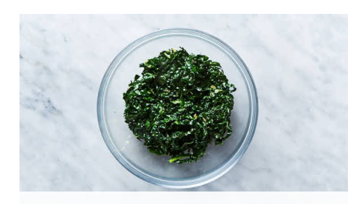
4. Cook kale

In a medium bowl, combine chicken, Parmesan, lemon zest, half of the shallot mixture, 1 teaspoon each of smoked paprika and salt, and a few grinds of pepper.