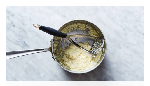
2. Make cauliflower mash

Cut half of the cauliflower into 1-inch florets (save rest for own use). Finely chop shallot. Pick and finely chop 1 tablespoon rosemary leaves; discard stems. Finely grate ½ teaspoon lemon zest, then cut lemon into wedges. Strip kale leaves from stems; discard stems. Thinly slice kale leaves into ribbons. Finely grate Parmesan.