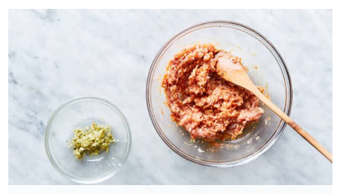
3. Prep chicken patties

Fill a medium pot with salted water ; add cauliflower florets . Cover, bring to a boil, and simmer until very tender, about 15 minutes. Drain cauliflower well, then return to pot. Use a potato masher or fork to mash cauliflower with sour cream and 2 tablespoons butter . Season to taste with salt and pepper . Cover to keep warm.