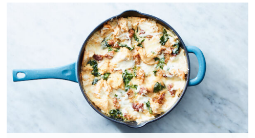
5. Soak & bake

Pour custard into skillet and gently toss to make sure everything is evenly mixed; spread into an even layer. Mix together remaining mozzarella, fontina, and Parmesan ; set aside until step 6.