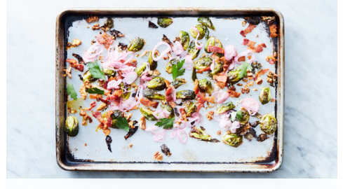
6. Finish & serve

Meanwhile, pat steaks dry; season all over with salt and a generous amount of pepper . Heat 1 tablespoon oil in a medium skillet over medium-high. Add steaks and cook until browned and medium-rare, 3-4 minutes per side. Transfer to a cutting board.