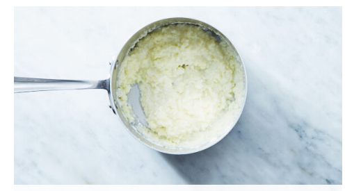
2. Boil cauliflower

Trim and halve Brussels sprouts ; quarter if large and keep any leaves that fall off. Finely chop 2 teaspoons garlic . Thinly slice shallot . Coarsely chop walnuts . Pick parsley leaves from stems ; thinly slice stems. Cut bacon into ½-inch strips.