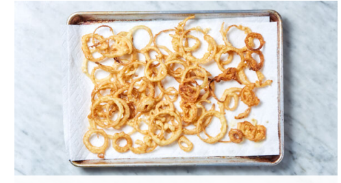
5. Fry onion rings

Broil on upper oven rack until well browned in spots and crispy, stirring halfway through, 8-10 minutes (watch closely as broilers vary). Add half of the barbecue sauce and 1 tablespoon water, tossing to coat.