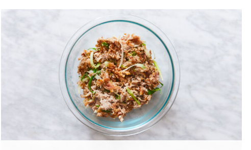
3. Brown pork

In a medium bowl, stir to combine sliced cucumbers and peppers, half of the chopped cilantro, 1 teaspoon each of oil and vinegar, and ½ teaspoon of the garlic. Season to taste with salt and pepper. In a small bowl, stir to combine mayonnaise and 1 teaspoon gochugaru flakes, or more depending on heat preference. Season to taste with salt and pepper.