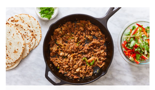
6. Brown tortillas & serve

Bring sauce to a simmer, then return pork to skillet. Continue to simmer until sauce is nearly evaporated, 3-5 minutes more.