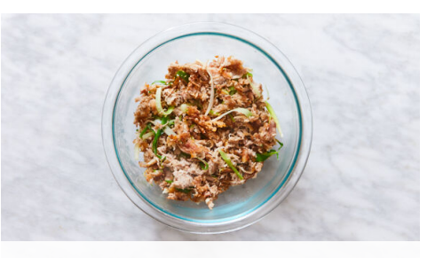
3. Brown pork

In a medium bowl, stir to combine sliced cucumbers and peppers, half of the chopped cilantro, 1 teaspoon each of oil and vinegar, and ½ teaspoon of the garlic. Season to taste with salt and pepper. In a small bowl, stir to combine mayonnaise and 1 teaspoon gochugaru flakes, or more depending on heat preference. Season to taste with salt and pepper.