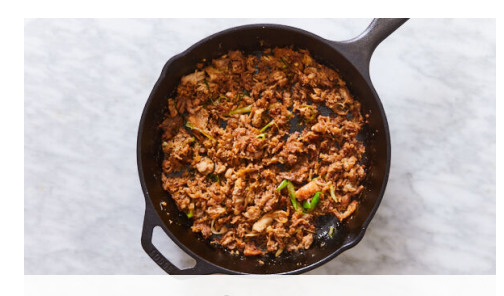
5. Simmer pork

Heat 1 tablespoon oil in a medium nonstick skillet over medium-high. Add pork and cook, breaking up large pieces, until browned on one side, 2-3 minutes. Add remaining garlic and half of the sliced scallions ; cook, stirring, until fragrant, 1-2 minutes. Transfer pork to a bowl. Wipe out skillet.