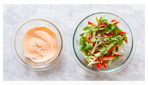
2. Make toppings

In same skillet, stir to combine ¼ cup sugar and 2 tablespoons water. Cook, without stirring, over medium heat until melted. Continue to cook, swirling skillet occasionally, until sugar is honey-colored, 4-5 minutes. Add all of the tamari and ½ cup water, and swirl (don't stir) to combine (caramel may harden, but will melt again).