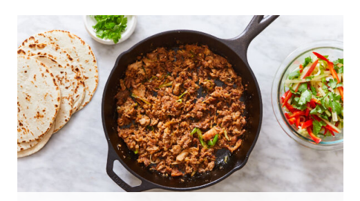
6. Brown tortillas & serve

Bring sauce to a simmer, then return pork to skillet. Continue to simmer until sauce is nearly evaporated, 3-5 minutes more.