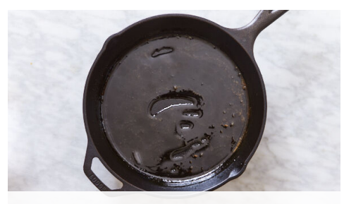
4. Make caramel

Halve pepper , discard stem and seeds; cut into 3-inch long thin strips. Peel cucumber , remove seeds if desired; cut half of the cucumber into thin matchsticks, about 3-inches long. Finely chop 2 teaspoons garlic . Trim scallions ; cut crosswise into 3-inch pieces, then thinly slice lengthwise. Transfer scallions to a bowl of cold water. Coarsely chop cilantro leaves and stems .