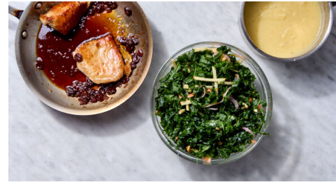
6. Finish & serve

Lower heat to medium; add chopped shallots to same skillet. Cook, stirring often, until softened and golden, 1-2 minutes. Add cherries, rice vinegar, broth concentrate, ¼ cup water , and 2 tablespoons sugar . Cook over high heat until sauce is thickened and syrupy, 3-5 minutes.