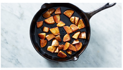
4. Pan-fry potatoes

Add Sriracha, <sup>1</sup>⁄<sub>2</sub> teaspoon of the chopped garlic, and a pinch of salt to softened butter. Use a fork to mash and stir to combine; set aside until ready to serve. In a small bowl, stir to combine remaining chopped garlic and <sup>1</sup>⁄<sub>2</sub> teaspoon each of salt and pepper; reserve for step 5.