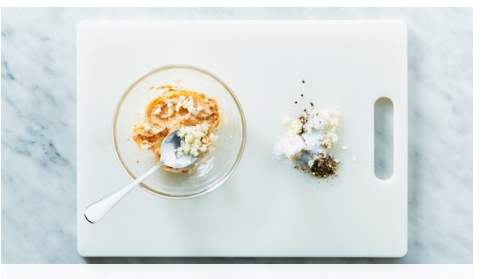
3. Season butter & garlic

Finely chop 2 teaspoons garlic . Scrub potatoes , then cut into 1-inch pieces. Trim green beans .