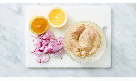
3. Prep chicken

Flip chicken , then squeeze all of the orange juice into skillet. Partially cover and cook over medium-high heat until chicken is cooked through, and pan sauce is reduced by half, 3-5 minutes. Stir in water, 1 tablespoon at a time, if sauce is dry before chicken is cooked through.