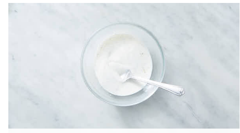
5. Make ranch

Add all but 2 lettuce leaves and toss to coat.