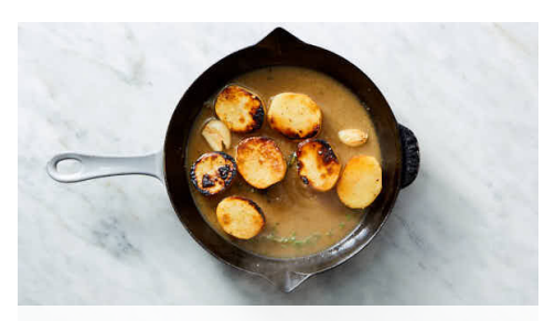
3. Add butter & broth

Heat 1 tablespoon oil in a medium ovenproof skillet over medium-high until shimmering. Add potatoes , cut side down, and cook, rotating skillet occasionally, until potatoes are deeply golden brown on the bottom, 5-7 minutes. Season with salt and pepper .