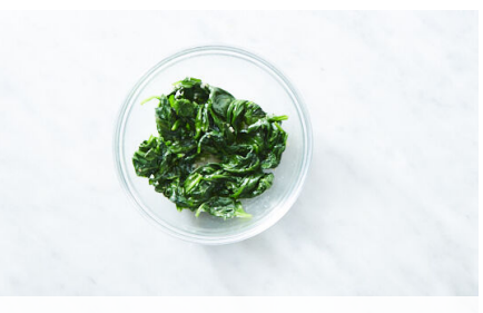
3. Sauté spinach

Into a small bowl, finely grate 1 teaspoon lemon zest and squeeze 2 teaspoons lemon juice . Cut remaining lemon into wedges.