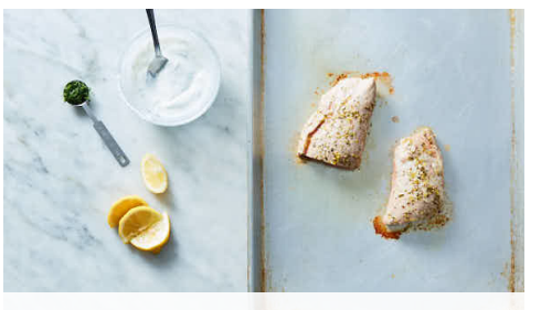
3. Cook pork & make tzatziki

In a medium bowl, combine zucchini, 1 tablespoon oil , and ½ teaspoon of the grated garlic. Season with salt and pepper , and toss to combine.