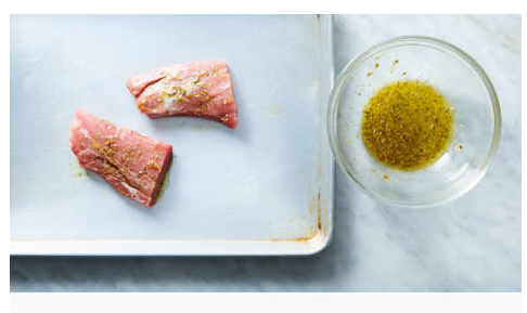
1. Marinate pork

Nutrition per serving Calories 740kcal, Fat 44g, Carbs 44g, Protein 47g