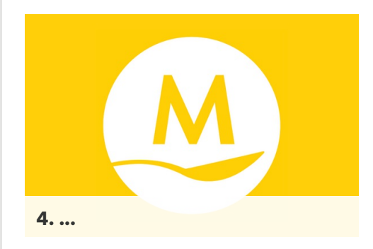
Looking for more steps?

Serve pesto chicken pasta garnished with sun-dried tomatoes . Enjoy!