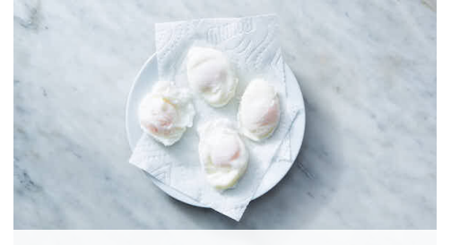
5. Poach eggs

Roast pork and kale on center oven rack until kale is tender and pork is browned in spots, 8-10 minutes. Finely grate 1 teaspoon lemon zest into a small bowl, then cut lemon into wedges. Finely chop 1 teaspoon garlic and dill fronds and stems . To bowl with zest, add garlic and dill . Sprinkle half of the gremolata over ingredients on baking sheet.