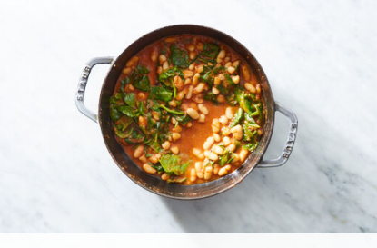
5. Simmer beans & spinach

Heat 1 tablespoon oil in a medium nonstick skillet over medium-high. Add remaining panko and cook, stirring occasionally, until toasted, 3–5 minutes. Transfer to a bowl.