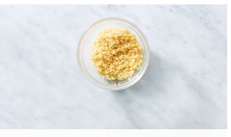
3. Toast panko

In a medium bowl, combine ground beef, garlic, ¼ cup panko, 1 large egg, 1 teaspoon salt, and a few grinds of pepper . Mix until fully combined. Roll into 8 meatballs, about 2 tablespoons each.