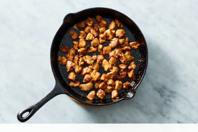
4. Cook chicken

In a medium bowl, stir to combine all of the taco seasoning and ½ teaspoon salt Add chicken ; toss to coat. Set aside until step 4.