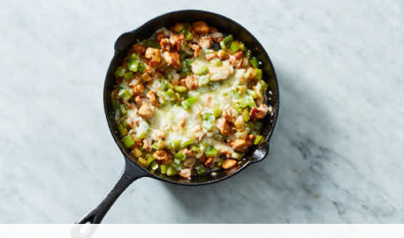
5. Assemble & broil skillet

Add tomatoes, chopped cilantro, finely chopped onions , and 1 tablespoon oil to bowl with lime juice; toss to combine. Season to taste with salt and pepper .