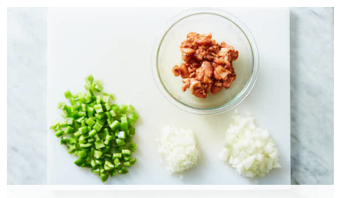
1. Prep ingredients

Calories 570kcal, Fat 36g, Carbs 23g, Protein 43g