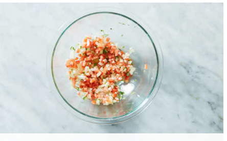
3. Make pico de gallo

Transfer to a bowl and cover to keep warm. Reserve skillet for step 4.