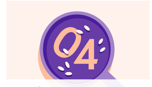
4. Sauté corn & serve

Roast on center oven rack until green beans are tender and browned in spots and pork is cooked through (145°F internally), 6–7 minutes.