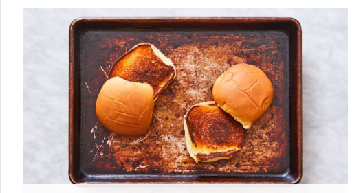
4. Toast buns

In a medium skillet, heat 2 teaspoons oil over medium-high. Add chicken ; cook, breaking up into large pieces, until browned and cooked through, 3-4 minutes. Add barbecue sauce ; bring to a simmer and cook, stirring occasionally, 1-2 minutes. Season to taste with salt and pepper .