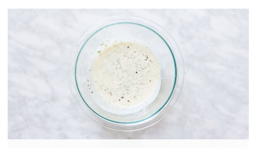
2. Make dijonnaise dressing

In a small bowl, stir to combine Dijon , mayonnaise , dill , and 2 teaspoons water . Season to taste with salt and pepper .