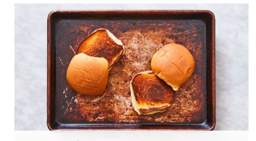
4. Toast buns

In a medium skillet, heat 2 teaspoons oil over medium-high. Add chicken ; cook, breaking up into large pieces, until browned and cooked through, 3-4 minutes. Add barbecue sauce ; bring to a simmer and cook, stirring occasionally, 1-2 minutes. Season to taste with salt and pepper .