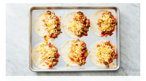
5. Build quesadillas

Add enchilada sauce and 3 tablespoons water to skillet with beef and veggies; bring to a simmer, scraping up bits from the bottom of the skillet. Cook, stirring, until water is evaporated and beef is nicely coated, 1-2 minutes more. Remove from heat and season to taste with salt and pepper.