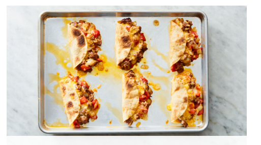
6. Broil & serve

Brush one side of each tortilla generously with neutral oil . Arrange tortillas on a rimmed baking sheet, oiled side down. Divide beef mixture among tortillas, spooning filling onto 1 half of each tortilla, then top with shredded cheddar-jack cheese . Fold in half to close. Transfer to a baking sheet in a single layer.