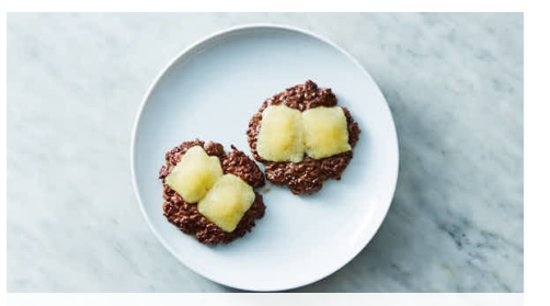
4. Cook cheeseburgers

Form ground beef into 2 (4-inch wide) patties. Season both sides with salt and pepper .