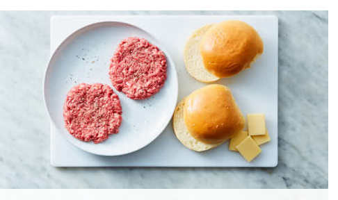
3. Prep burgers

Meanwhile, thinly slice shallot crosswise into rings. In a small bowl, whisk to combine 2 tablespoons vinegar , 1 teaspoon sugar , and a large pinch of salt . Add shallots to bowl and toss to coat. Set aside at room temperature, stirring occasionally, until ready to serve.