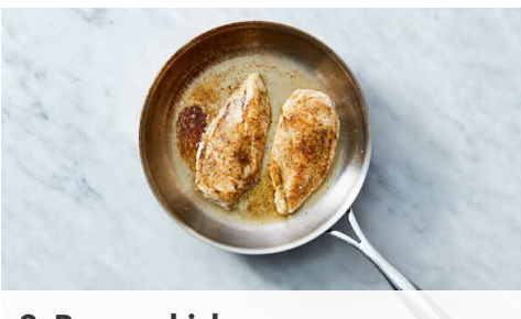
3. Brown chicken

Finely chop shallot . Remove core from apple , then cut half into ¼-inch cubes (save rest for own use). Pat chicken dry; season all over with salt , pepper , and 1 teaspoon poultry seasoning . In a medium bowl, whisk together 2 tablespoons oil and 1 tablespoon each of the vinegar and of the chopped shallots ; set dressing aside until step 6.