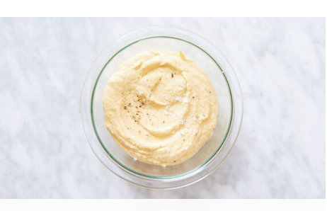
3. Make hummus

In a medium bowl, stir to combine tomatoes, chopped cilantro, and a drizzle of oil. Season to taste with salt and pepper.