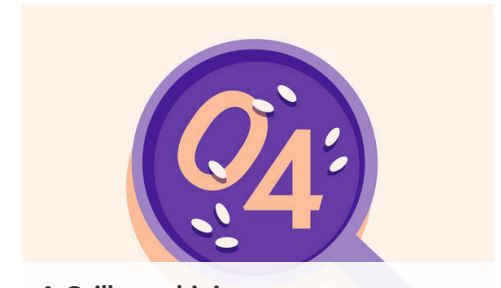
4. Grill zucchini

In a medium bowl, combine Tuscan spice blend and 1 tablespoon oil . Season with salt and pepper .