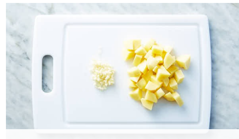
1. Prep ingredients

Calories 770kcal, Fat 31g, Carbs 78g, Protein 40g