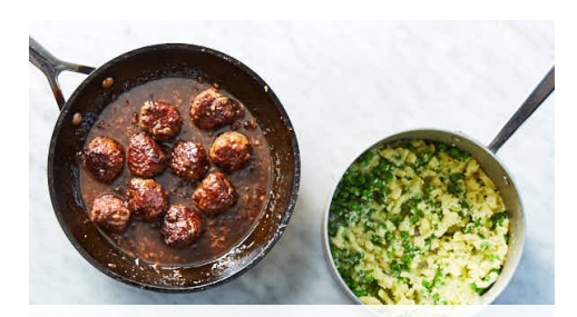
6. Finish & serve

Heat 1 tablespoon oil in a medium nonstick skillet over medium-high until shimmering. Add meatballs (should sizzle vigorously) and cook, turning once or twice, until browned but not cooked through, 6-8 minutes. Remove from heat, then tilt skillet and spoon off as much excess fat as possible. Stir remaining chopped garlic into skillet. Cook over medium-high heat, about 1 minute.