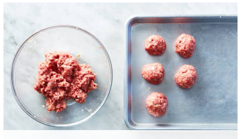
2. Prep meatballs

Finely chop 1 tablespoon garlic . Peel potatoes , then cut into 1-inch pieces. Bring a medium saucepan of salted water to a boil; cover to keep warm over low heat until step 4.