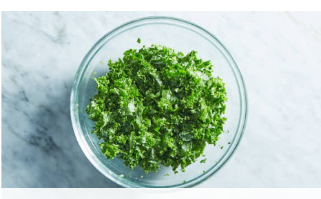
3. Prep kale

Add to a small saucepan with ¼ cup water, 2½ tablespoons vinegar , and 1 tablespoon sugar . Bring to a boil. Reduce heat to medium and cook until liquid is reduced to a syrup, 3-4 minutes. Season to taste with salt .