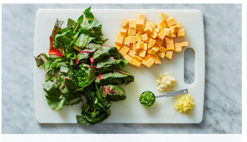
2. Prep ingredients

Preheat oven to 450°F with a rack in the upper third. In a medium bowl, combine 1 tablespoon oil , 2¼ teaspoons berbere spice , and a generous pinch of salt . Pat chicken dry, then add to marinade, rubbing all over to coat. Set aside until step 4.