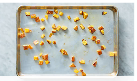
3. Roast butternut squash

Finely chop 2 teaspoons each of peeled ginger and garlic . Finely chop 1 tablespoon jalapeño (or more, or less depending on heat preference). Remove Swiss chard leaves from tough stems; discard stems. Cut leaves into 1-inch wide ribbons. Cut butternut squash into ½inch pieces.