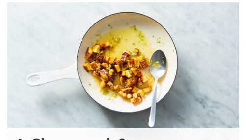
6. Glaze squash & serve

Heat 1 tablespoon oil and 1 teaspoon of the chopped garlic in same skillet over medium-high until fragrant, about 1 minute. Add Swiss chard leaves in handfuls, stirring after each addition, until tender, 3–5 minutes. Season to taste with salt and pepper. Transfer to a bowl and cover to keep warm. Wipe out skillet.