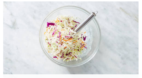
5. Make ranch slaw

Brush half of the reserved glaze all over chicken and cook, turning, until glaze is charred in spots, about 1 minute more. Transfer to plates.