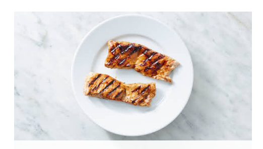
4. Cook chicken

While beans cook, preheat a grill pan over medium-high heat. Cut each chicken breast horizontally (parallel to cutting board) almost completely in half. Open up like a book and pound to an even ¼-inch thickness; rub with oil and season all over with salt and pepper .