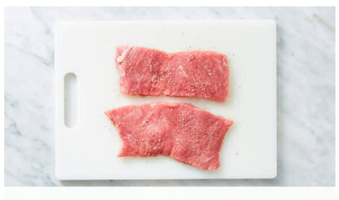
3. Prep chicken

Add beans and their liquid to saucepan with barbecue glaze . Cook over mediumhigh heat, stirring occasionally, until thick and stewy, 5-6 minutes. Cover to keep warm until ready to serve.