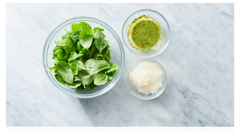
5. Make salad

Bake pizza on bottom oven rack until dough is browned and cheese is bubbling, 12-18 minutes (watch closely as ovens vary).