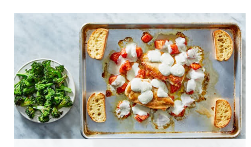
6. Finish & serve

Meanwhile, heat 1 tablespoon oil in same skillet over medium-high. Add green beans, remaining chopped garlic, 2 tablespoons water , and a pinch of salt . Cover and cook until crisptender, 2-3 minutes. Uncover and cook until water is evaporated and green beans are browned in spots, 2-3 minutes.