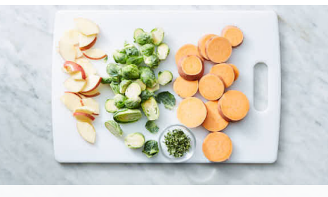
2. Prep ingredients

Preheat oven to 450°F with racks in the lower and upper thirds. Pat chicken dry, then use a sharp knife to cut chicken horizontally (parallel to cutting board), stopping knife just before cutting through. Open like a book and use a meat mallet (or heavy skillet) to pound to an even ¼-inch thickness.