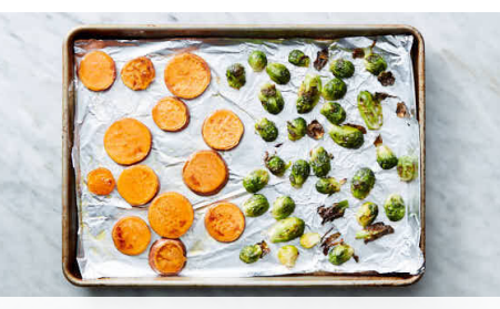
3. Roast vegetables

Scrub sweet potato , then slice into ½inch thick rounds. Trim Brussels sprouts , remove any outer leaves if necessary, then halve lengthwise (or quarter if large). Quarter apple ; discard core. Cut 2 quarters crosswise into ¼-inch thick slices (save remaining apple for own use). Pick and finely chop 2 teaspoons thyme leaves ; discard stems.