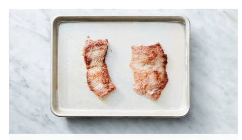
5. Cook butterflied chicken

Carefully flip sweet potatoes , then brush with 1 tablespoon maple syrup , and sprinkle with 1 teaspoon of the chopped thyme . Transfer to upper oven rack and roast until Brussels sprouts are deeply browned and sweet potatoes are caramelized, 3-5 minutes more. Remove from oven and set aside until ready to serve.