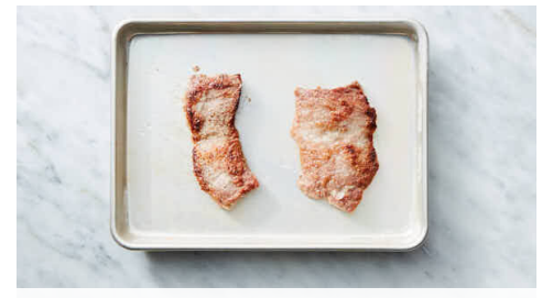
5. Cook butterflied pork

Carefully flip sweet potatoes , then brush with 1 tablespoon maple syrup , and sprinkle with 1 teaspoon of the chopped thyme . Transfer to upper oven rack and roast until Brussels sprouts are deeply browned and sweet potatoes are caramelized, 3–5 minutes more. Remove from oven and set aside until ready to serve.