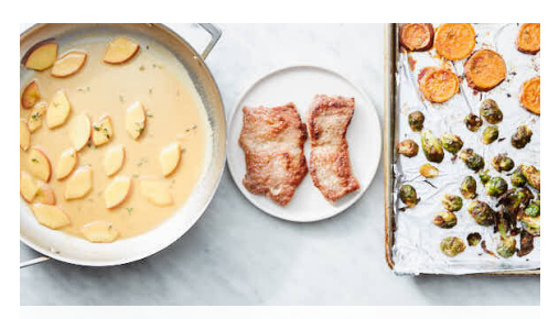
6. Make pan sauce & serve

Meanwhile, place ¼ cup flour in a shallow bowl. Season pork all over with salt and pepper; dredge pork in flour, shaking off any excess. Heat 1 tablespoon oil in a medium skillet over high until shimmering. Add pork, in batches if necessary; cook, turning once, until pork is cooked through and browned on both sides, 7-9 minutes total. Transfer pork to a plate.