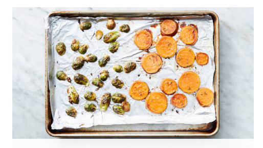
4. Finish vegetables

Line a rimmed baking sheet with aluminum foil. Transfer sweet potatoes and Brussels sprouts to prepared baking sheet; toss with 1 tablespoon oil and season with salt and pepper . Position Brussels sprouts cut side down. Roast on lower oven rack until Brussels sprouts are lightly browned and underside of sweet potatoes are golden brown, about 10 minutes.