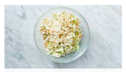
6. Assemble & serve

Off heat, stir in 3 tablespoons of the chimichurri sauce . Season to taste with salt and pepper .