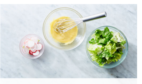
3. Prep salad

Heat 1 tablespoon oil in a medium skillet over medium-high. Add beef and season with a pinch each of salt and pepper . Cook until well browned, 5-7 minutes.